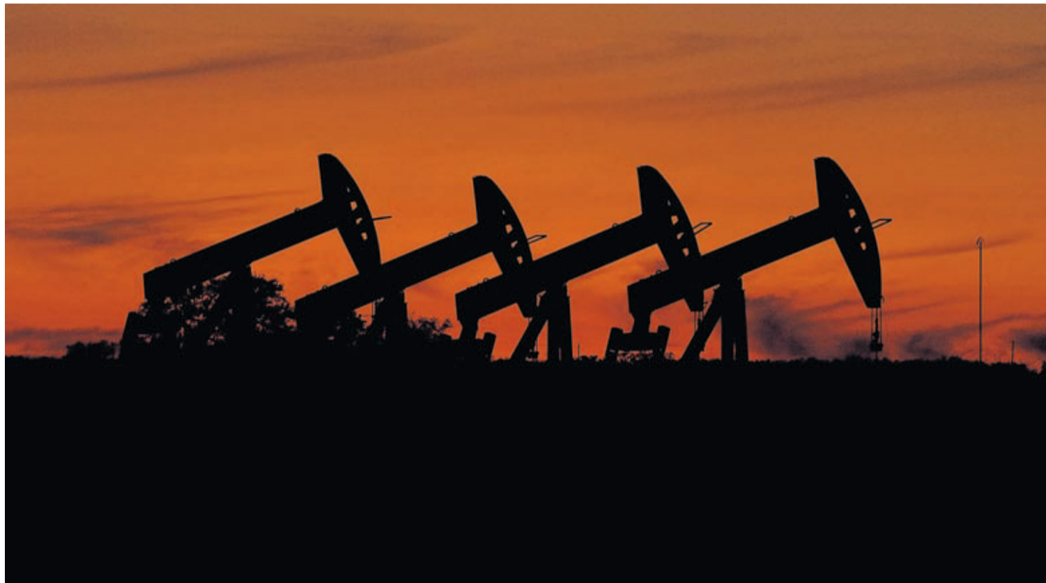
Oil pump jacks operate at dusk near Barnes City, Texas, Wednesday, Nov. 1, 2023.